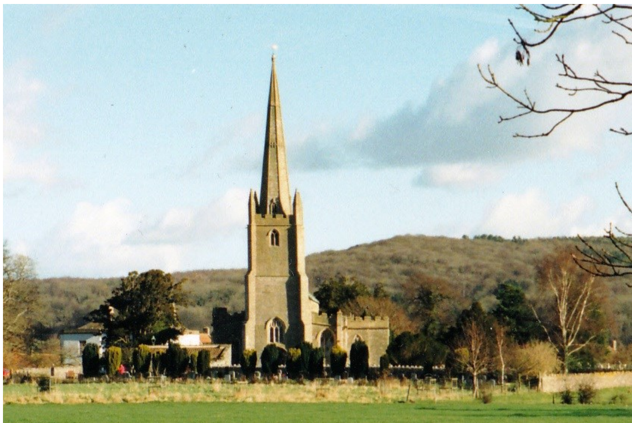
Congresbury church.

This publication is an attempt to provide a detailed history and guide to St Andrew's church, the Refectory and surrounding grounds.